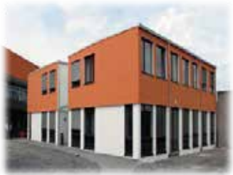
Container Production Plant Dusseldorf | Germany 1 x 400 kVA