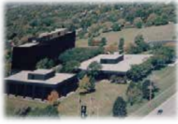
Tunisia Armed Forces | Tunisia 3 x 225 kVA & 2 x 330 kVA