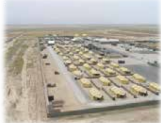
USA Army | Afghanistan 18 x Several Sized Gensets