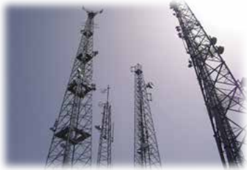
Telecom Base Stations | Georgia 276 x Several Sized Gensets