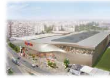
Megamall Shopping Centre Bucharest | Romania 1 x 1033 kVA