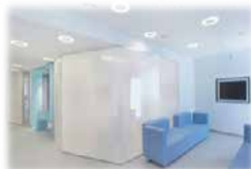
Roznov Clinic | Czech Republic 2 x 400 kVA