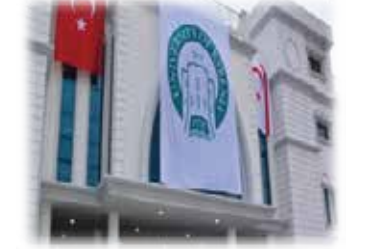
Hospital of University of Kyneria | Cyprus 1 x 440 kVA