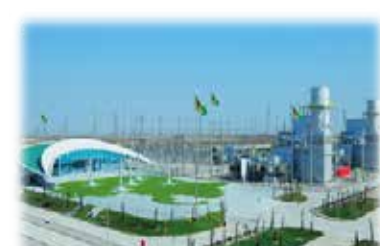
Water Plant | Turkmenistan 1 x 2500 kVA