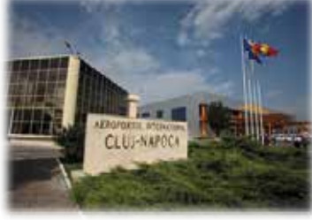
Cluj Airport | Romania 2 x 400 kVA