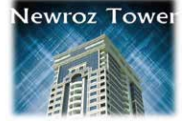
Newroz Tower | Iraq 10 x 1125 kVA (Synchronized)