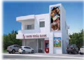
Near East Bank | Cyprus 11 x Several Sized Gensets