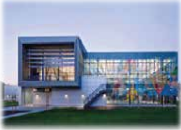
Sport Complex | Czech Republic 1 x 460 kVA