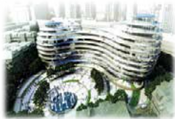
White City Life Complex | Azerbaijan 1 x 1385 kVA