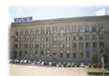
Beltelecom | Belarus 1 x 1385 kVA