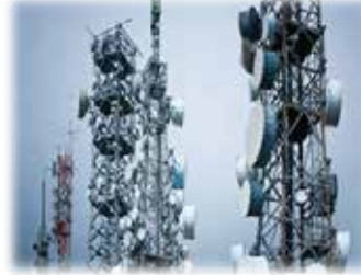
Kazak Telecom | Kazakhstan 60 x Various Type of Gensets