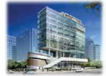
Technopark | Israel 1 x 615 kVA