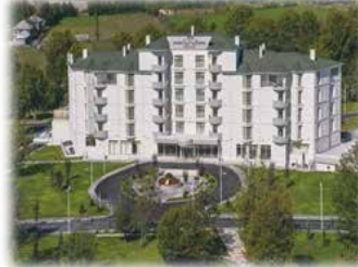
Qafqaz Yengice Thermal Hotel | Azerbaijan 2 x 1125 kVA (Synchronized)