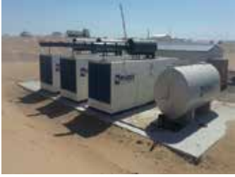
Hyundai Engineering Co. | Turkmenistan 3 x 1385 kVA Container Type Synchronized