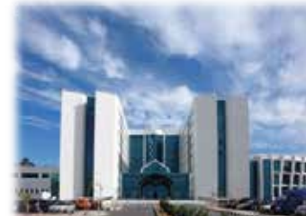
Near East University | Cyprus 1 x 330 kVA