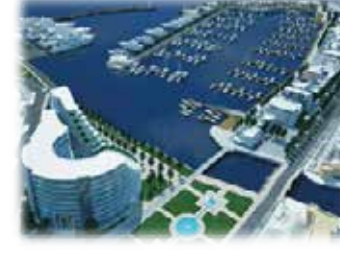
Marina Bizerte | Tunisia 1 x 450 kVA & 1 x 550 kVA