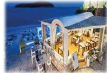
Dubrovnik Beach Club Dubrovnik | Croatia 1 x 400 kVA