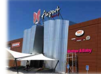
Airport Mall | Cyprus 3 x 700 kVA (Synchronized)