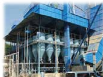
Rice Factory | Bangladesh 3 x 660 kVA (Container Type)