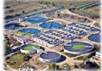
Halac Water Purification Plant | Turkmenistan 2 x 1125 kVA