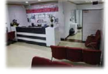
VIN Hospital & Medical Complex | Iraq 3 x 700 kVA (Synchronized)