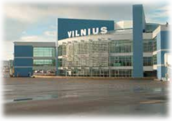
Vilnius Airport | Lithuania 1 x 650 kVA