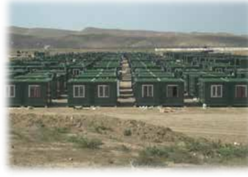
Nato Military Camp | Bulgaria 6 x 400 kVA