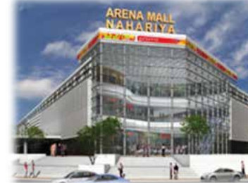
Arena Mall | Israel 1 x 700 kVA