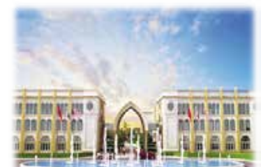
University of Kyneria | Cyprus 2 x Various Type of Gensets