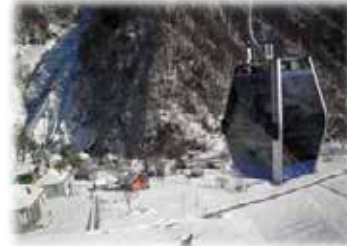
Tufandag Ski Resort Holiday Complex | Azerbaijan 2 x 1125 kVA (Synchronized)